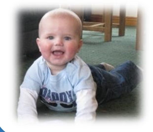
Birth – 2 years

Sit opposite your baby and sing the song with them. Hold hands and help them clap the rhythm as you sing the rhyme.